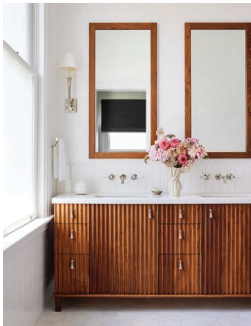
ABOVE Luxe touches define the primary bathroom, such as the wall light by Flanders with a linen shade, Walker Zanger Wilshire Pattern Bianco Bello floor tile and wall tiles by Tile Bar.