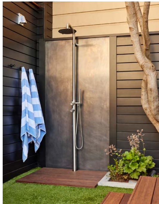
LEFT/ABOVE Outdoor entertaining is seamless and elegant using a dining table from Gloster and iron armless dining chairs by Harbour Outdoor with fabric by Perennials. The freestanding outdoor shower is by Signature Hardware.